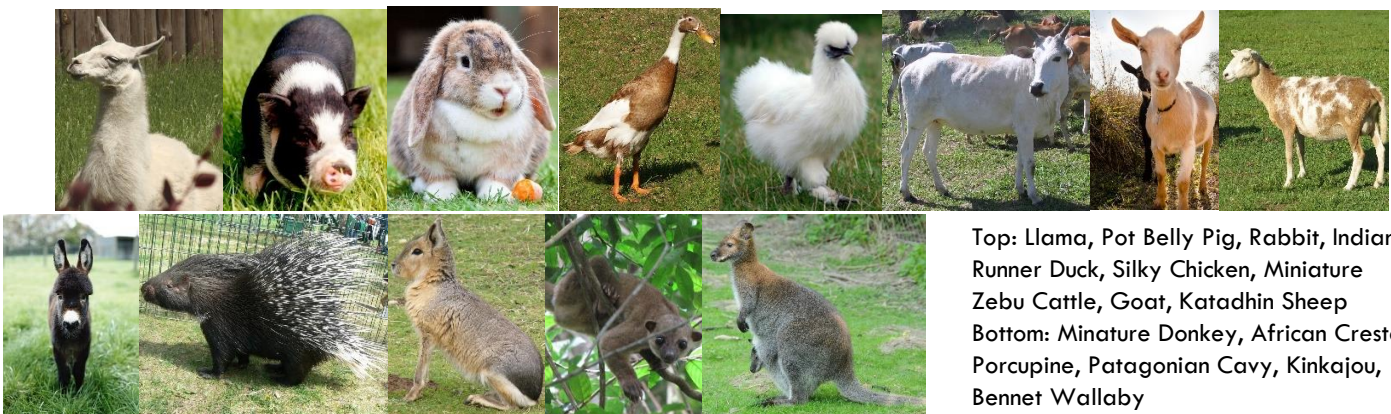
Top: Llama, Pot Belly Pig, Rabbit, Indian Runner Duck, Silky Chicken, Miniature Zebu Cattle, Goat, Katadhin Sheep Bottom: Miniature Donkey, African Crested Porcupine, Patagonian Cavy, Kinkajou, Bennet Wallaby

Look for these animals at the petting zoo: